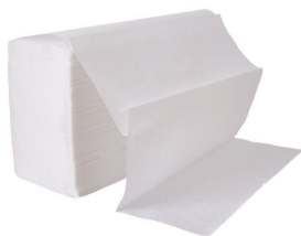
190-251 Z Fold Towel (3000) 2 ply white