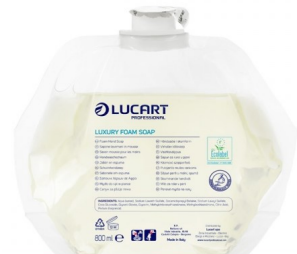
180-252 Handwash Foam Soap (6 pack) 800ml