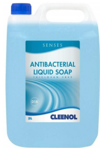
180-301 Antibacterial Liquid Soap 5L

Please Note: We are sourcing hand sanitiser, Anti Bac Soap etc from at least 3 suppliers currently due to the shortage. Your delivery may not be in the brand pictured here.