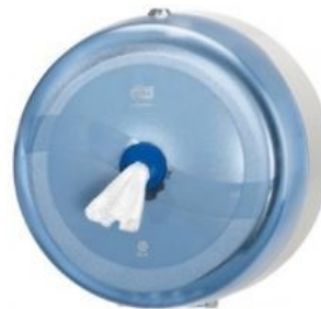
180-258 Centre Feed Toilet Tissue Dispenser