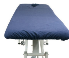
180-200(with face hole) & 180-239(without face hole) Terry Towel Couch Cover Navy with or without breathe hole,