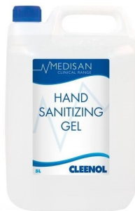
190-262 Hand Sanitiser 5L