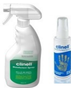
190-217 Clinell Surface & Equipment Spray 500ml 190-218 Clinell Surface Sanitizer 60ml