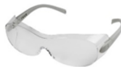
190-458 Protective Glasses