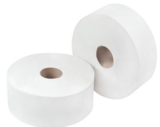
180-374 Centre Feed Toilet Tissue (Pack 6)