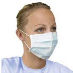
190-456 Medical Face Mask (30 pack) EN14683 Rating class 1, Type II standard