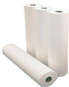
180-102 (20"x 40m) Couch Roll