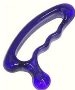
180-110 Index Knobber €8.95+VAT