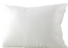
180-255 Medical Wipeable Pillows

This fully wipeable healthcare pillow As it is easy to wipe clean, it can help in the fight against infection and increase clinic hygiene.