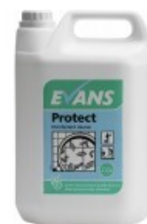
190-465 Disinfectant Cleaner 5L Can be used on floors, walls and variety of hard surfaces