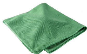
180-302 Premium Microfibre Cloths (10 pack) 40x40cm Machine washable Use with Surface Disinfectant Spray