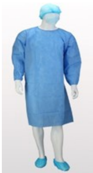
190-460 Disposable Medical Gown (long sleeved)

Please Note: Images may not be exacty as shown here. Please view our website Infection Control Page for the most up to date images as they may vary depending on supplier