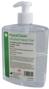
190-406 Alcohol Hand Sanitizer Gel 500ml