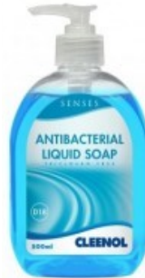
180-287 Antibacterial Liquid Soap 500ml