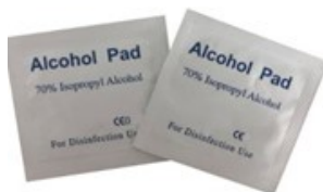
190-219 Alcohol Prep Pads Skin cleaning wipes can be used for Surface cleaning also