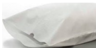
210-245 Disposable Pillow Covers (10 per pack) Single-patient use, Designed to fit all standard size pillows.

This fully wipeable healthcare pillow As it is easy to wipe clean, it can help in the fight against infection and increase clinic hygiene.