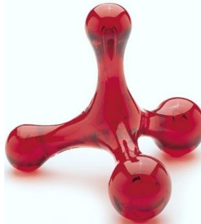
180-109 Jack Knobber €8.95+VAT