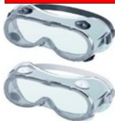
190-457 Protective Goggles

We are awaiting deliveries of goggles, glasses and gowns and will add them to the website page when they arrive