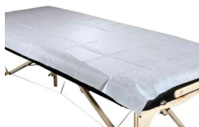
210-246 Disposable Couch Covers (10 per pack) Single Patient use

High quality paper rolls in 40m lengths. Double ply thickness. 20" wide