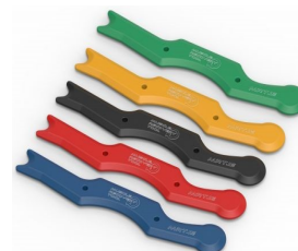
130-518 MRT Tool €59+VAT