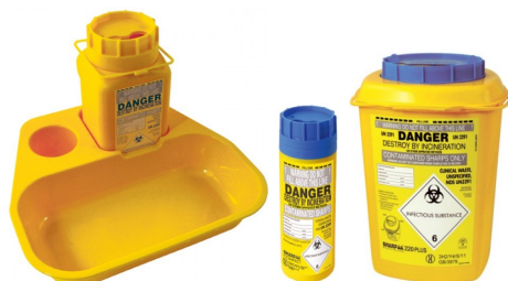
155-106 Procedure Tray (use with sharp box) Takes 0.5L(round) or 1.63L (square) sharp box 155-102 Sharp Box 0.5L 155-116(2) Sharp Box 1L 155-104 Sharp Box 1.58L 155-125 Sharp Box 5L