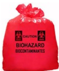
190-173 Bio-Hazard Bags (x25)