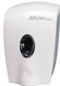
180-249 Handwash Foam Soap Dispenser

Range of Wall Mount Dispensers and Refills also available. See latest updates on our Infection Control Page on the website www.sportsphysio.ie