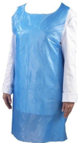
190-461 Disposable Apron (100s & 200s)