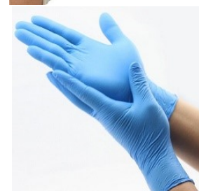
Various Disposable Gloves Latex—Powdered & Powder Free Nitrile & Vinyl (100s)