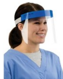
190-459 Protective Disposable Face Shield

Please Note: Images may not be exacty as shown here. Please view our website Infection Control Page for the most up to date images as they may vary depending on supplier