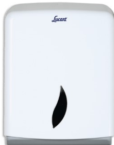
190-250 Z Fold Towel Dispenser