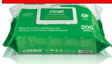
190-216 Clinell Surface & Equipment Wipes (200)

Clinell range out of stock currently— Please see website Infection control page for availability